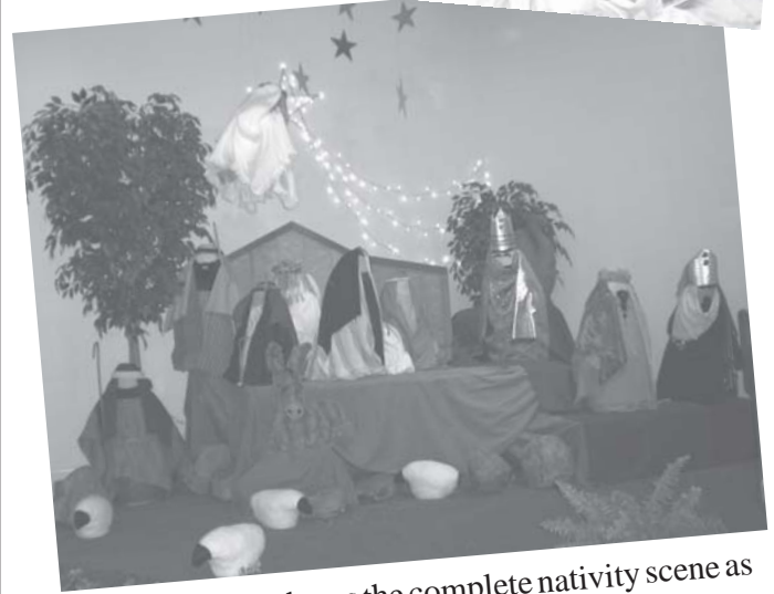
The above photo shows the complete nativity scene as created by those mentioned in the article.