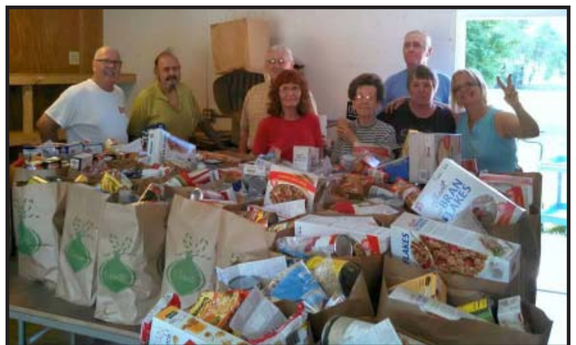
Picture taken at recent Food Pantry work day when 95 bags of food were filled for distribution by this group of willing workers.